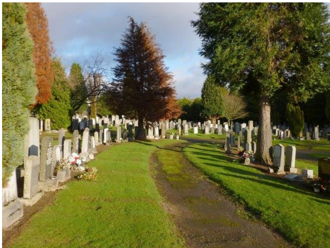
Dumbarton Cemetery, Dunbartonshire