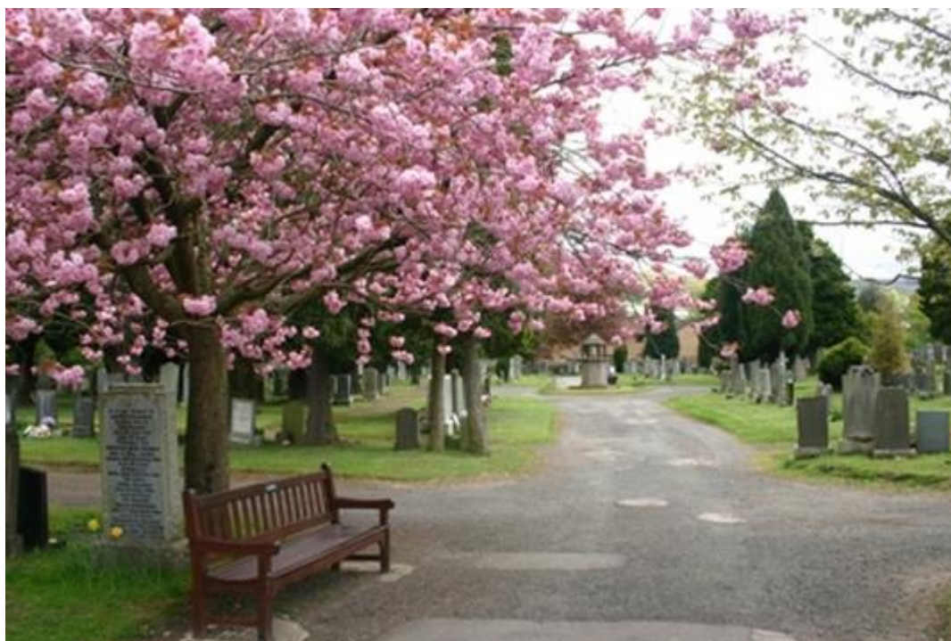
Dumbarton Cemetery, Dunbartonshire

Dumbarton Cemetery contains 56 Commonwealth War Graves – 17 relate to World War 1 & 39 relate to World War 2.